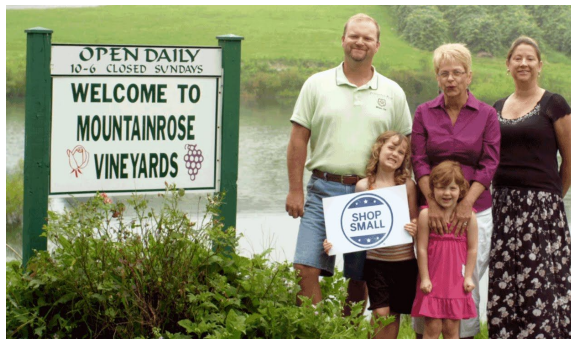
Left: a family-owned winery on a reclaimed strip mine in Wise, VA. Right: the Leipziger solar farm in Germany, which was constructed on a reclaimed coal processing site