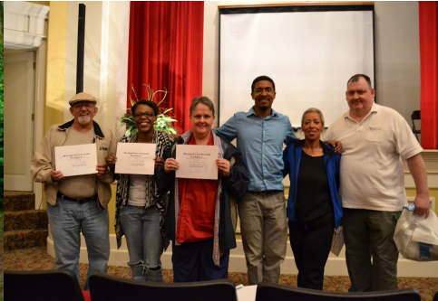
Left: a reclaimed stream in MD supports a $3 million recreational tourism industry. Right: residents of Benham, KY, one of many localities that have publicly urged Congress to pass the RECLAIM Act